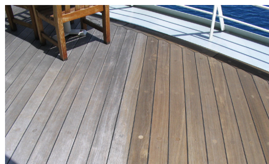
Before Bio Degreaser After Bio Degreaser

No acids, no two part process just one phosphate free, pH neutral, cleaner Hepburn Bio Degreaser Simple, safe, non-flammable and non-corrosive.